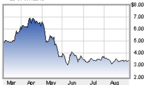
■ IDERA PHARMACEUTICALS INC as of 9/7/2010